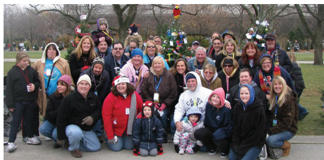
Chicago Parrot Heads at the Brookfield Zoo Tree Decorating/ Scavenger Hunt

The registration for MOTM 2012 begins on January 2, 2012 and will be November 1-4, 2012. It is time to start saving money for the annual trip to Key West or ask Santa for airfare to Key West. "Trip around the Sun" is the theme for 2012 MOTM.